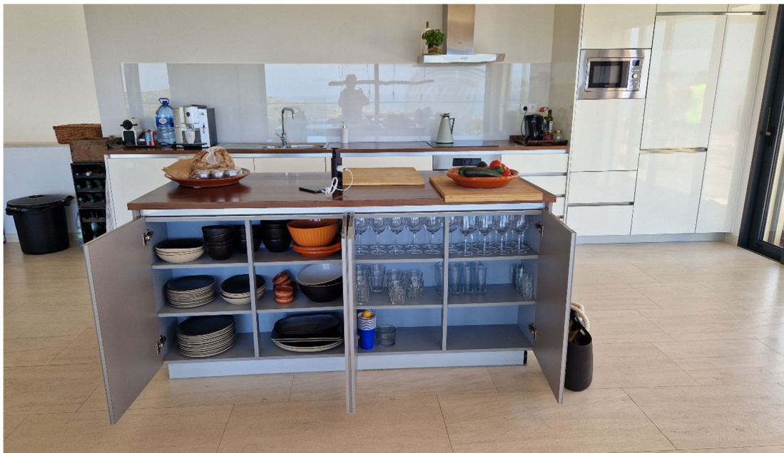
Ap. Pinheiro: kitchen